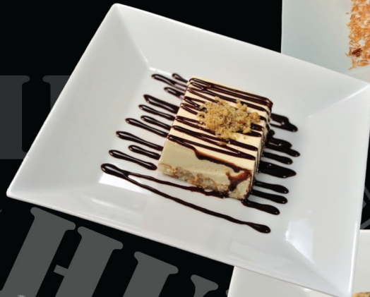
bavarian cream $6.99