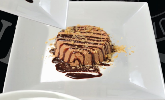
chocolate mousse $6.99