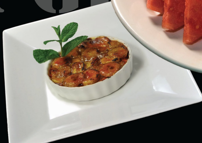
creme brulee $8.99