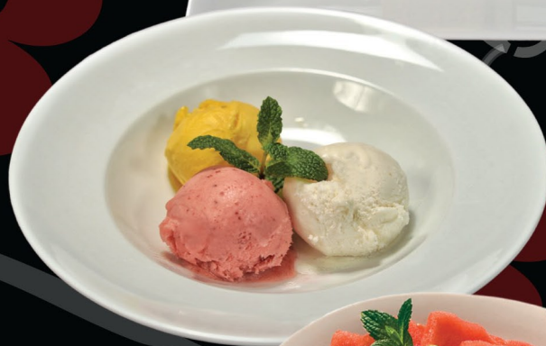
sorbet flavors $6.99